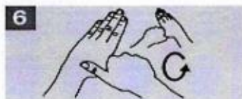
Rotational rubbing of left thumb clasped in right palm and vice versa;