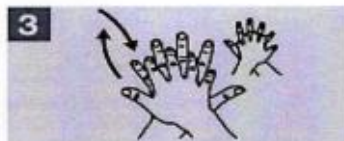
Right palm over left dorsum with interlaced fingers and vice versa;