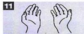
Your hands are now safe.