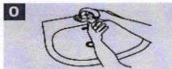
Wet hands with water;