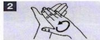
Rub hands palm to palm;