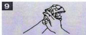
Dry hands thoroughly with a single use towel;