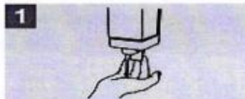
Apply enough soap to cover all hand surfaces;