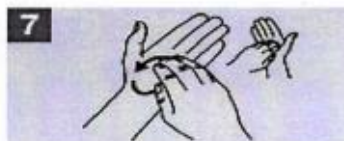
Rotational rubbing, backwards and forwards with clasped fingers of right hand in left palm and vice versa;