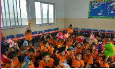
Show and Tell