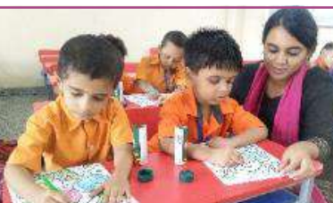
Say No To Plastic