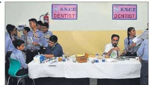
• A team of 15 doctors and 22 volunteers of SNCF conducted the camp

Sant Nirankari Charitable Foundation (SNCF) organised a health camp at Sant Nirankari Public School, Govindpuri to ensure healthy lifestyles.